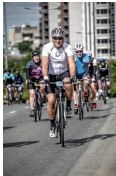
Cycling the Ride London 100-mile Essex