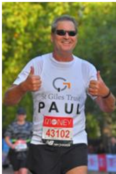
Running the London Marathon