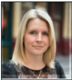
New team member -

Donations have also been made to MIND, Leigh UTC School and CPR Recycling in Godstone, Surrey.